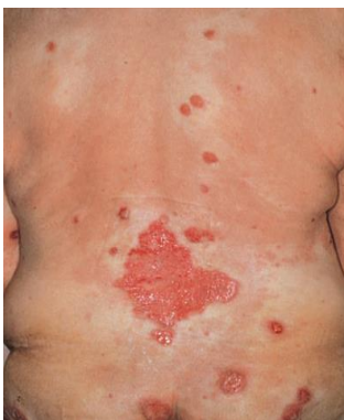
Fig 5: Patient with pemphigus vulgaris on sacrum area. It is shown krusta [10]

The clinical picture is shown in Figure 5. In 60% pemphigus vulgaris, there are abnormalities in the oral mucosa. Nikolsky's sign for pemphigus vulgaris is positive. This disease predilection is general (can appear in all parts of the body). If a direct immunofluorescence examination is performed, IgG and its complement can be seen in the epidermis. This disorder does not involve gastrointestinal disorders, disorders related to gluten sensitivity, and no involvement of HLA. Therapy of this disease is carried out using corticosteroids and cytostatics. [1, 7, 10]