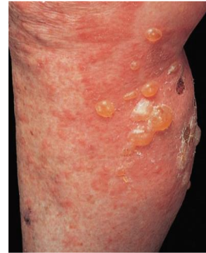
Fig 6: Patients with pemphigoid bullosa [11]

disorder does not involve gastrointestinal disorders, disorders related to gluten sensitivity, and no involvement of HLA. Therapy of this disease is carried out using corticosteroids [7, 11] .