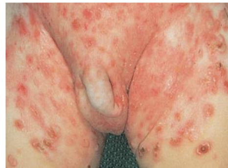
Fig 7: Linear IgA dermatosis in children has a clinical picture similar to dermatitis herpetiformis so it is difficult to distinguish it. The diagnosis is confirmed by performing an immunological examination [12] .

For Linear IgA dermatosis as shown in Figure 6, differentiation from dermatitis herpetiformis will be difficult if it only relies on clinical and histopathological examinations. Additional examination in the form of immunological examination will be able to distinguish these two diseases [7, 12] .