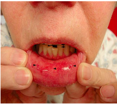
Fig 4: Multiple erosion on the lips [8]