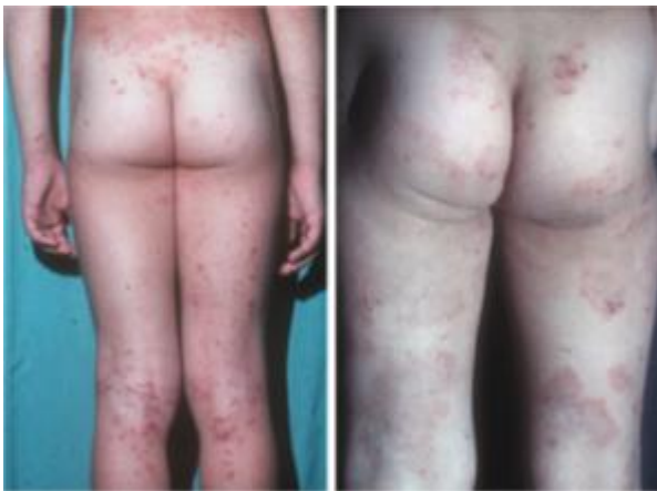
Fig 9: Comparison of atopic dermatitis and dermatitis herpetiformis (Left) Pediatric patients suffering from atopic dermatitis, (Right) pediatric patients suffering from dermatitis herpetiformis [14]

Whereas in dermatitis herpetiformis, the infantile form begins to appear in the second year of life. The lesion type atopic dermatitis is eczematous, whereas in dermatitis herpetiformis the lesions are typically erythematous and infiltrative lesions with flat, circinate surfaces with easily visible vesicles. The distribution of lesions in atopic dermatitis in children in the first year of life is often on the face, and in the following, on the flexor surfaces of the elbows and knees. Whereas in children suffering from dermatitis herpetiformis, the lesions are usually centripetal, often on the chest, especially the scapular region and the base of the trunk, especially the triangular area of the extensor surface of the forearm with a base on the elbow. In atopic dermatitis, the skin prick test for atopy is often positive, and in atopic dermatitis there is no improvement in the introduction of a gluten-free diet [1,7,14] .