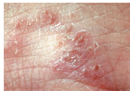
Fig 8: Clinical sign of scabies [13] .

Authors in other literature have also found that dermatitis herpetiformis was diagnosed as compared to scabies, and hypersensitivity was due to insect bites. For scabies, the morphology of the scabies is papules, vesicles and a scabies tunnel as a pathognomonic sign as shown in Figure 7. The distribution of scabies is usually in the gaps of the fingers, wrists, ulnar region of the forearm, genitals and lower abdomen. It stands out is that scabies definitely responds to anti-scabies therapy [7]