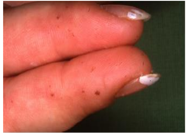
Fig 3: Purpura on the fingers of patient suffering from dermatitis herpetiformis [4]

A rare clinical manifestation is purpura on the palms. This clinical picture is more common in children, but several cases in adults have also been reported. Clinically purpura appears on the hands, as in Figure 3, and / or the soles of the feet. It is suspected that trauma is an etiological factor. No dorsal surface involvement of the hands and feet was reported [1, 4].